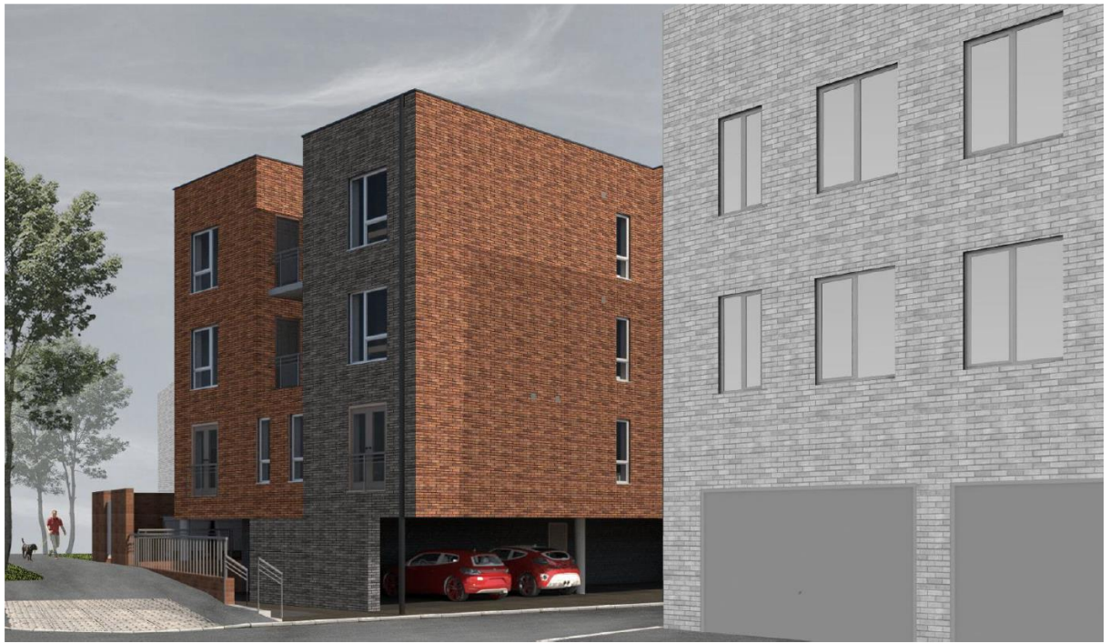
3D Visualisation in the street scene from Greenbrow Road